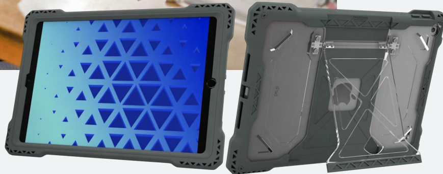
Custom-fit for the iPad 9/8/7

Exponentially more protective and with more functional features than its predecessors, the Shield Extreme-X2 provides a perfect fit for the iPad 9 and other 10.2" iPads. The new design features dual layers of tough TPU for outstanding impact and drop protection: a cushioning inner layer of TPU with an oil- and dirt-resistant outer layer. The removable screen protector enables easy replacement and reinsertion as needed. The virtually break-proof FlexStand kickstand provides unlimited, stable positioning options thanks to the easy-sliding friction hinge. The custom-fit design delivers easy access to all ports, openings, and buttons. Durable, updated corner anchors make it easy to add an (optional) hand strap, shoulder strap or any clip-on accessory.